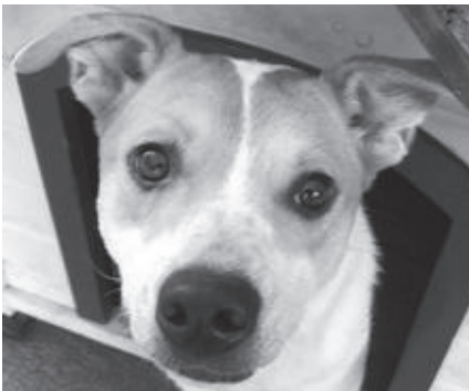
Hi! I'M MATTIE I'M A CATTLE DOG TERRIER MIX

We are a self-contained liscened and insured canine attraction needing a 50ft. x 60ft. deep area to show everybody what we love doing with our forever family so keep an ear up and when you hear that we are in your area come check them out! Until then keep them doggies roll'in.