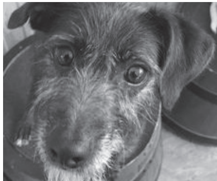
Hi! I'M MONKEY I'M A TERRIER MIX