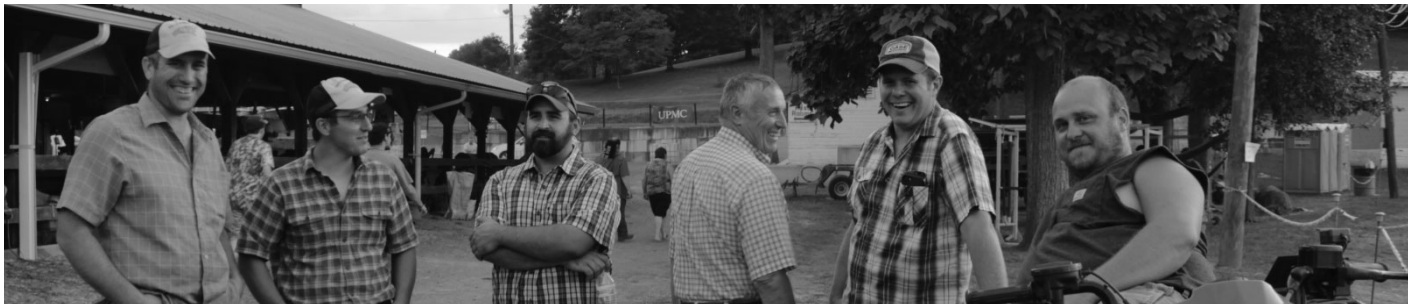
Directors Past & Present