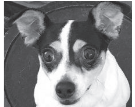
Hi! I'M MISS MiMi I'M A TOY FOX TERRIER